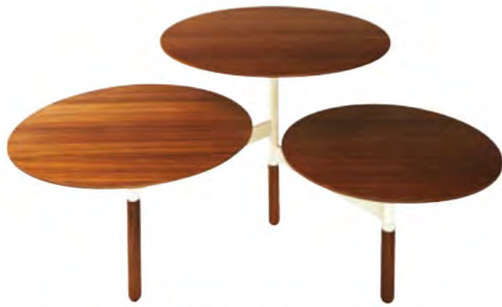
Blu Dot's Lily Pad coffee table is walnut with powder-coated steel. Blu Dot is at Hold It Contemporary Home, Mission Valley and Progress, South Park.