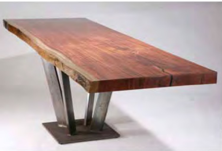
This custom dining table by Clyde Turner's CTT Furniture in San Diego County's Sorrento Mesa is a 9-foot-long slab of Bubinga on a hot-rolled steel base with black patina finish.