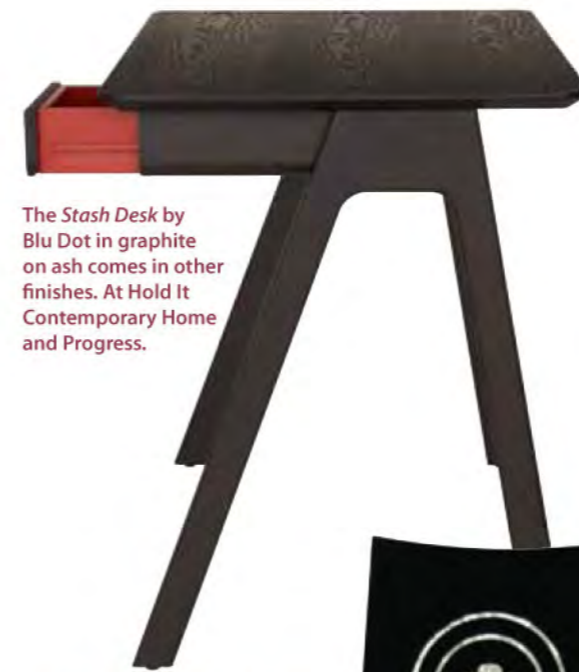
The Stash Desk by Blu Dot in graphite on ash comes in other finishes. At Hold It Contemporary Home and Progress.