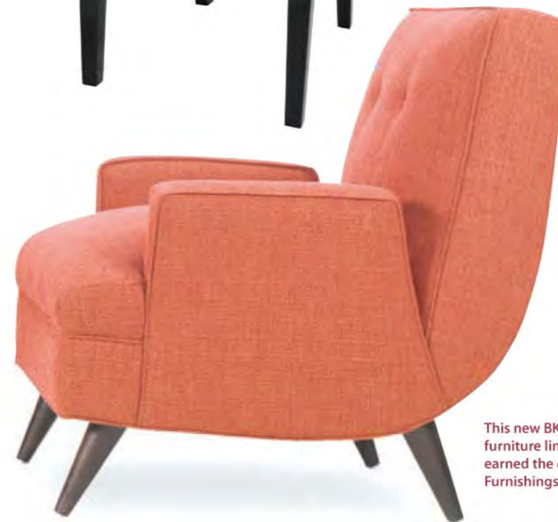
This new BKind3 chair is part of their eco-friendly furniture line manufactured in North Carolina that has earned the company membership in the Sustainable Furnishings Council. BKind3 at Progress.